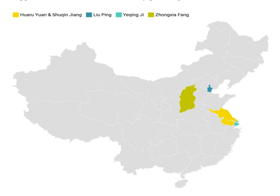
Figure 1 a map showing the regions of the narratives (exclude Dongfang Ma).

suppression from localities of family planning.