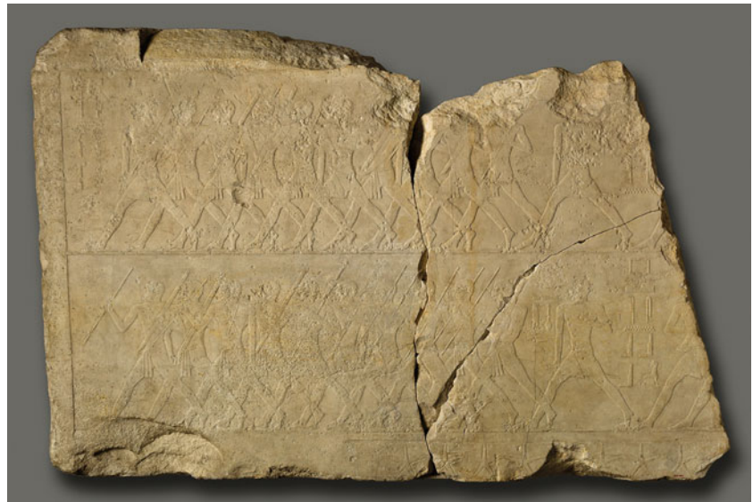
Figure 3. Defacements on a block from the reign of Userkaf, found in Amenemhat I's Lisht pyramid.