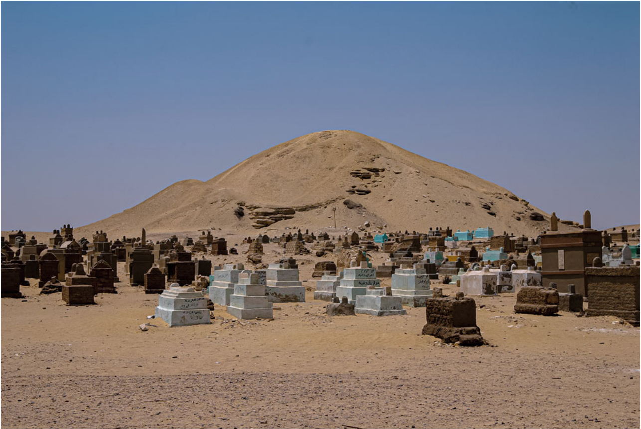
Figure 1. The pyramid of Amenemhat I at Lisht, with a modern cemetery in the foreground that shows the continued significance of the site.

is partly composed of reused blocks from the early Twelfth Dynasty, as well as the Old Kingdom. The reused Twelfth Dynasty elements include blocks from Amenemhat I's short-lived earlier pyramid, also at Lisht—an understandable reuse of material, since this second pyramid was begun later in his reign (Arnold & Jánosi 2015, 56; Jánosi 2016, 1, 4–12). More importantly for our purposes, the pyramid is also an 'almost inexhaustible source' of reused blocks from Old Kingdom structures (Goedicke 1971, 2; for catalogues of these blocks, see Goedicke 1971 and the in-depth study of the Lisht monuments in Jánosi 2016). The quantity of Old Kingdom material has in fact not been fully ascertained, since the blocks are so embedded in the monument that identifying all of them would require dismantling the pyramid (Berman 1985, 70). Many of the blocks were discovered in the foundations and core of the pyramid, in the foundations of the pyramid temple, or scattered throughout the site, which has made it difficult for excavators to identify exact findspots (Jánosi 2008, n. 26; 2016, 13). Furthermore, it is expected that the