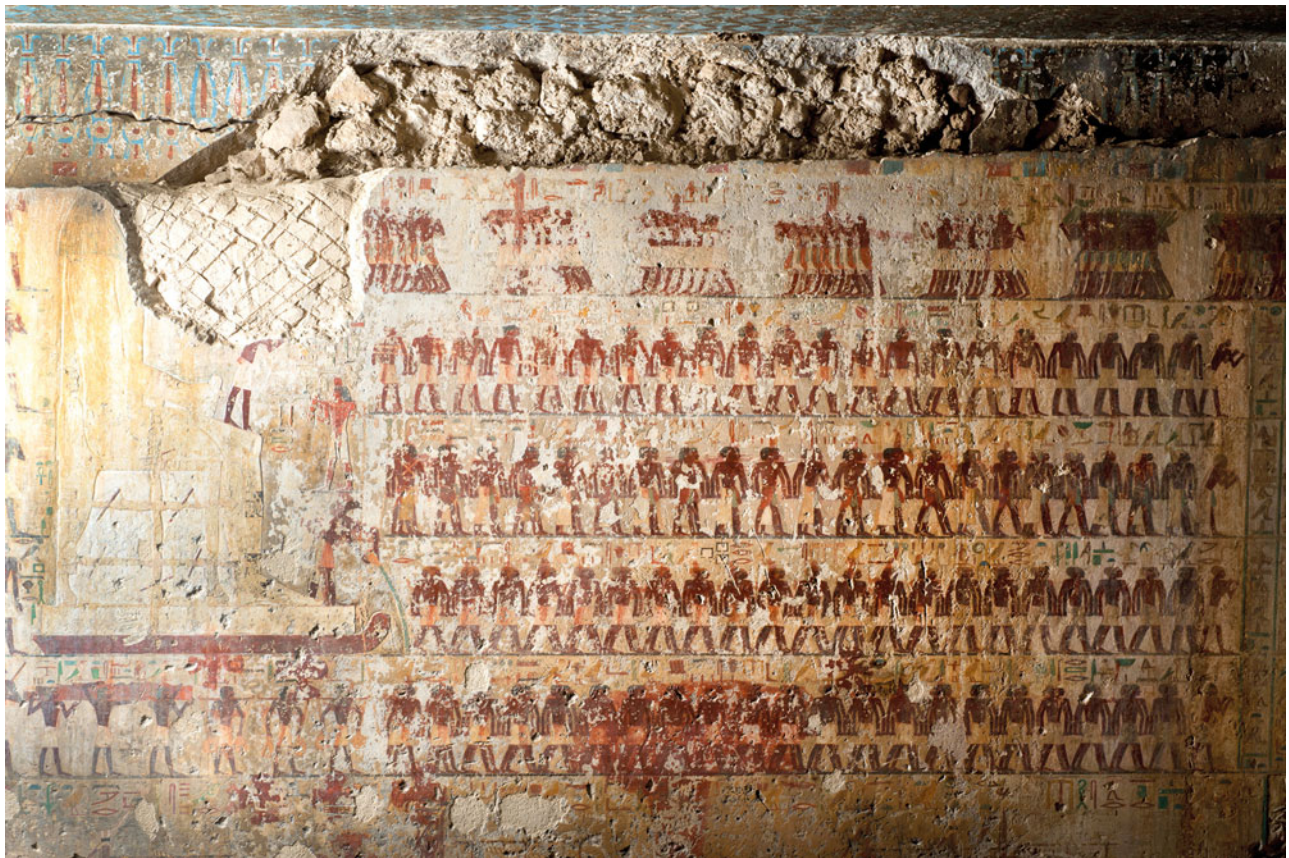
Figure 5. Painting showing the transportation of Djehutihotep's statue.

which details the transportation of a statue of the official Djehutihotep, is split into five episodes. Djehutihotep himself, along with some of his attendants, is shown following the statue in procession;