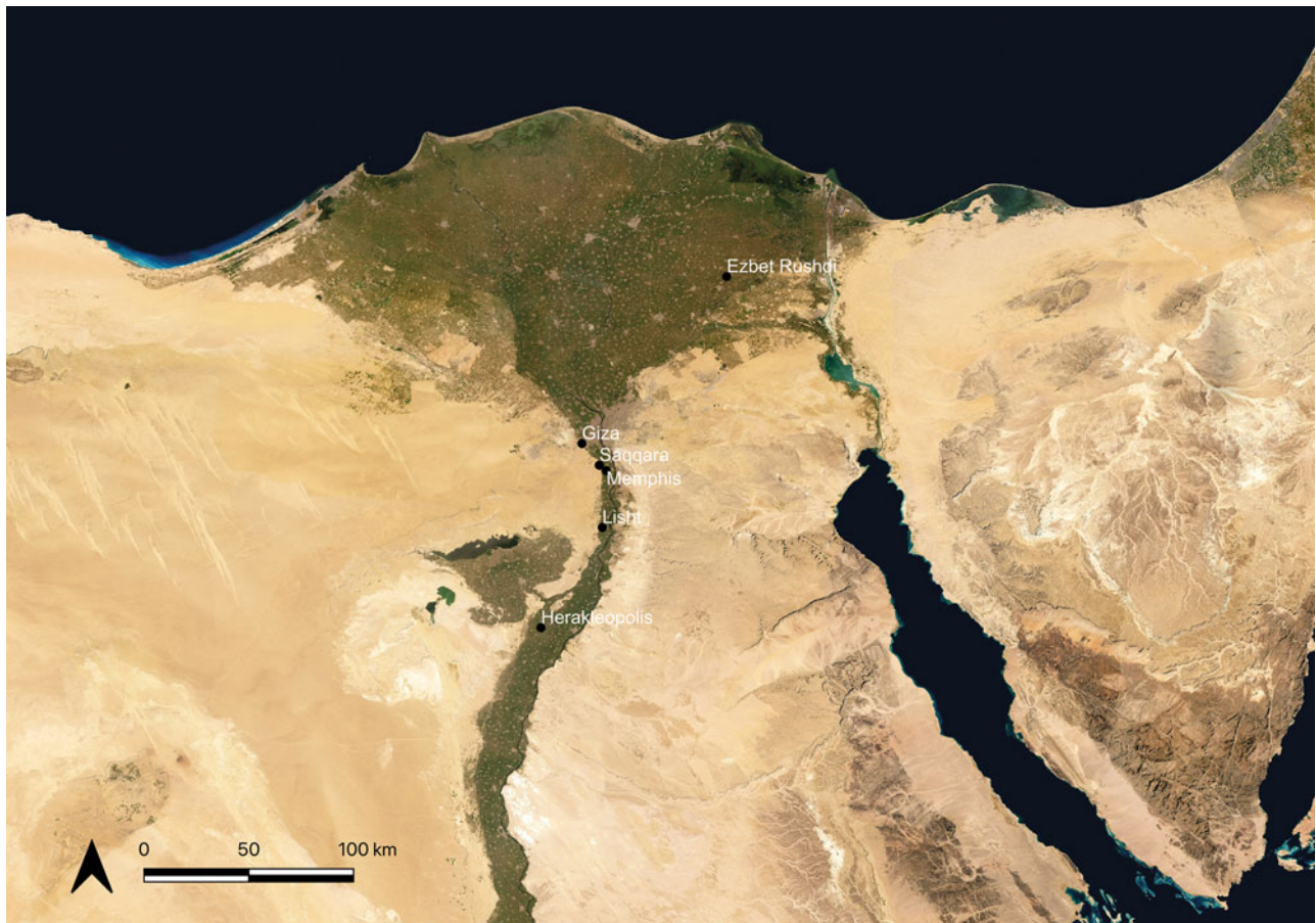
Figure 2. Map of the main sites mentioned in this article.

Kingdom royal funerary monuments at Giza and Saqqara (Fig. 2). The complexes from which the blocks seem to have been taken include those of Khufu and Khafre (Fourth Dynasty), Userkaf, Djedkare-Isesi and Unas (Fifth Dynasty) and Pepy II (Sixth Dynasty) (Goedicke 1971, 4; Jánosi 2008, 59; 2016, 13). Uphill (1984, 205) added Pepy I to this list, but his name has not been definitively found on any blocks. However, it is possible that other kings, including Pepy I, should be added to the list, since a significant number of blocks currently inside the pyramid have not been accessed (Jánosi 2008, 59). The partial cartouche identified as that of Pepy II could have instead belonged to Pepy I. Additionally, a block seems to mention the name of Pepy I's pyramid and might thus have come from the king's mortuary complex (Jánosi 2016, 27–8).