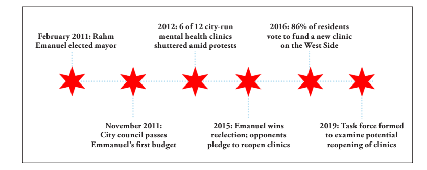
Figure 1: Timeline of Mental Health Clinic Closings in Chicago. Illustration by author.

Emanuel left office in 2019, when the city council formed a task force to reexamine the closings (see fig. 1).<sup>10</sup>