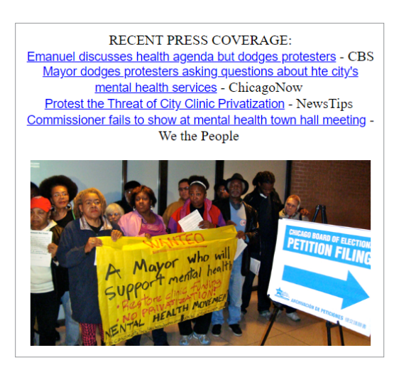
Figure 2: STOP Press Coverage, 2011.

STOP's online presence echoed this language, highlighting the failure of the mayor and the health commissioner to meet with activists or listen