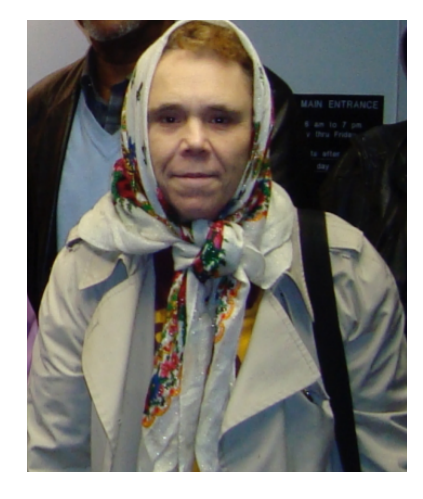
Figure 4: Statements by Trina Carpenter and Helen Morley, 2011. Mental Health Movement, Dumping Responsibility: The Case Against Closing CDPH Mental Health Clinics (Chicago: Mental Health Movement, Jan. 2012), 1, 4, documents .pub/reader/full/dumping-responsibility-the-case-against-closing-cdph-mental-health-dumping.