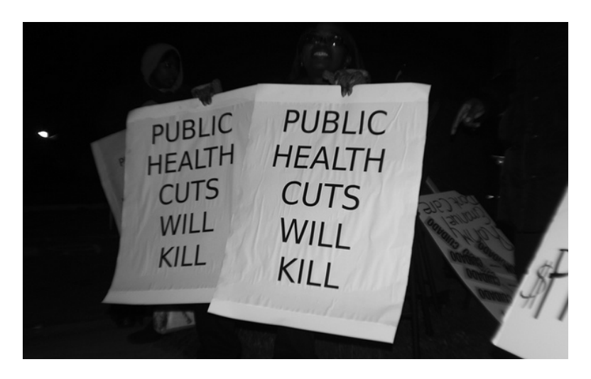
Figure 5: Aaron Cynic, "Protesters Stage Sit-In of Woodlawn Mental Health Clinic," Chicagoist, Apr. 13, 2012, chicagoist.com/2012/04/13/protesters_stage _sit-in_of_woodlawn.php.

of Emanuel's North Side home. 103 Closing plans moved ahead and protests continued, focused on the deadly impact of cuts (see fig. 5). 104 In response, Emanuel's administration insisted that its clinic plan was rational and would improve service: "The Administration is committed to promoting the health and wellness of Chicagoans in every neighborhood. The Department of Public Health is implementing reforms that