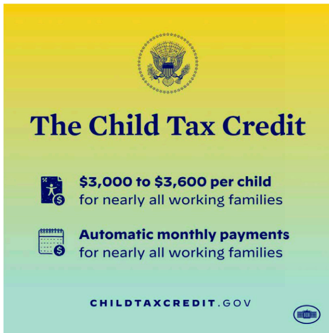
Fig. 1. Instagram post advertising the CTC benefit amount on a yearly basis. Posted on the White House Instagram page (@whitehouse) on June 21, 2021.

Two related factors, the ease of budget creation and the timing of expenses, may help explain individuals' distaste for yearly budgeting. First, people have more difficulty creating yearly (vs. monthly) budgets (7). As a result, individuals have lower confidence in their yearly budget estimates than their monthly budget estimates. Second, people incur expenses on a frequent basis, with the average person incurring 70 expenses per month (8). The tendency to create budgets across relatively short periods (e.g., weekly or monthly vs. yearly) may reflect the complexity of people's financial lives.