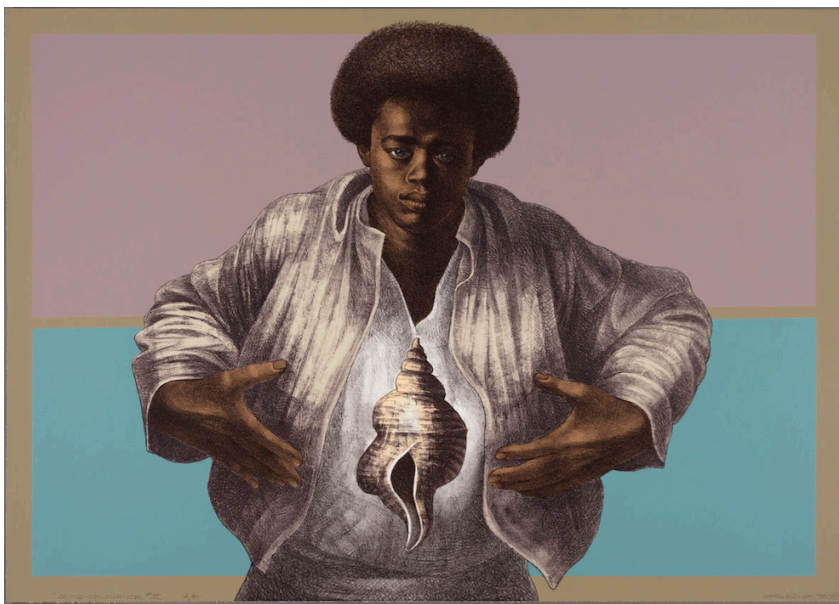
Fig. 3: Charles White. Sound of Silence . 1978. Lithograph, 25 1/8 x 35 5/16" (63.8 x 89.7 cm). The Art Institute of Chicago, Margaret Fisher Fund. The Charles White Archives. The Art Institute of Chicago