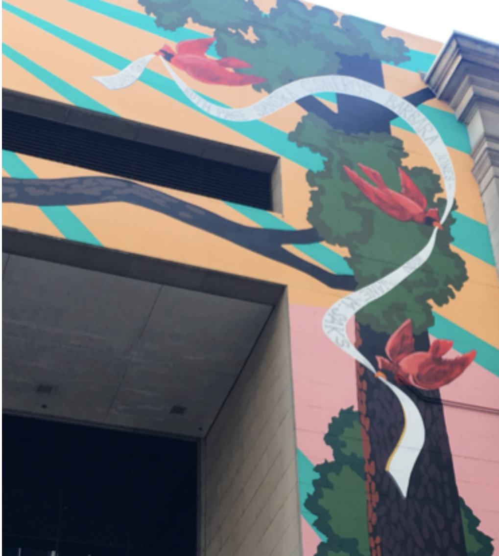
Fig. 13: Kaesha Freyaldenhoven. Kerry James Marshall's Ribbon on Rush More . 2017. Acrylic on limestone. 130 ft by 132 ft. Rush More, Chicago Cultural Center.