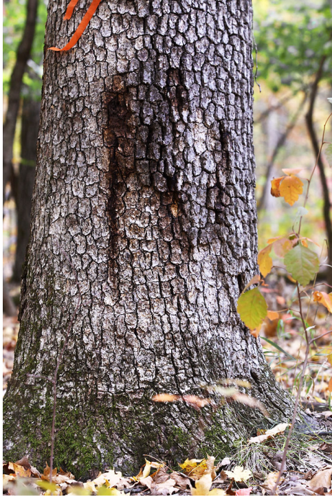
Fig. 8: Caroline Murray. White Oak Tree. 2013. Baskett Wildlife Research and Education Center. https://www.columbiamissourian.com/news/local/white-oak-decline-mysterious-to-foresters/article_b323f676-69d3-5802-8ff8-9e7454c6d452.html