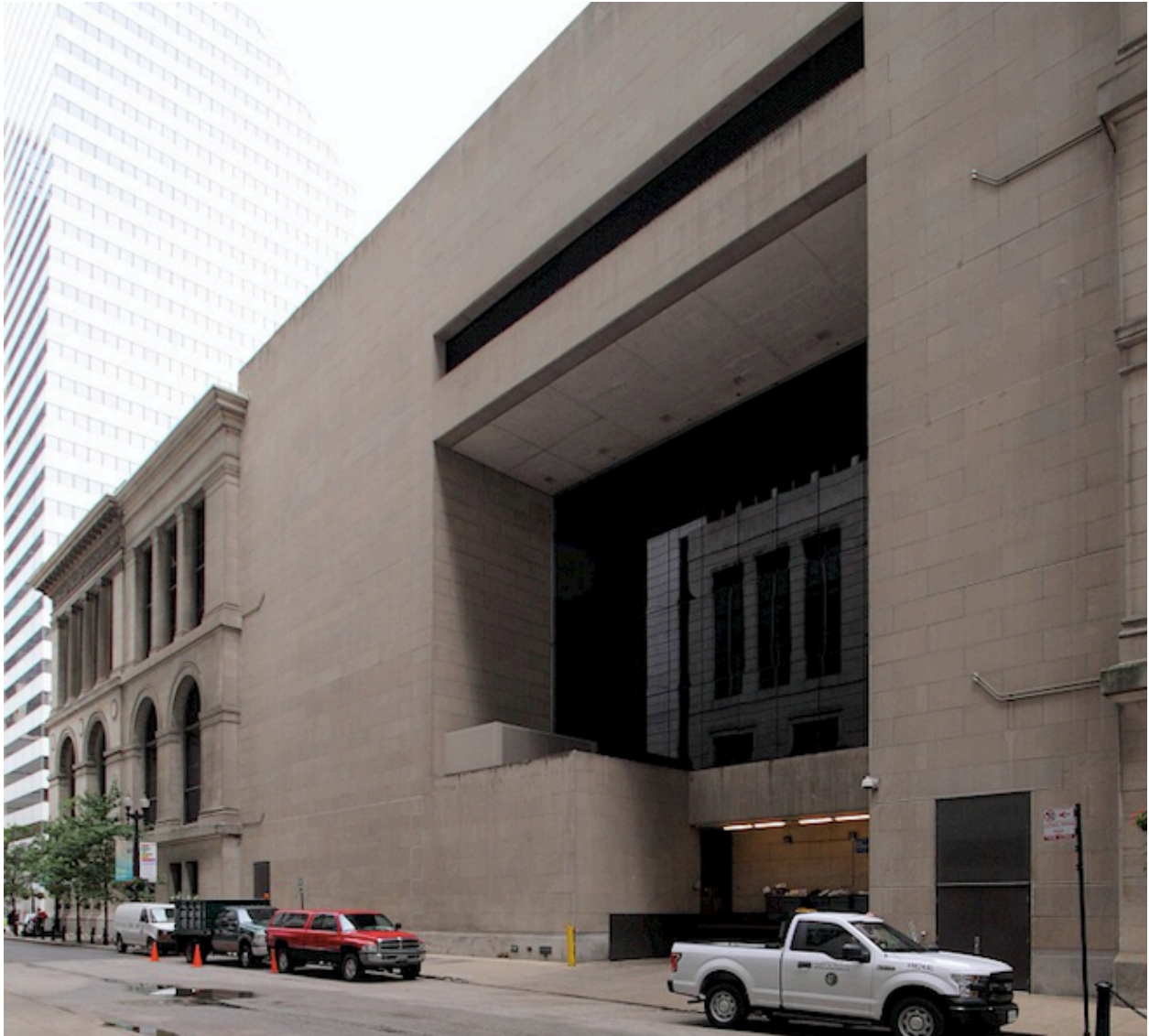
Fig 6: Iker Gil. Addition by Holabird and Root as seen from Garland Court. Chicago. 2017. http://chicagoarchitecturebiennial.org/blog/chicago-cultural-center/