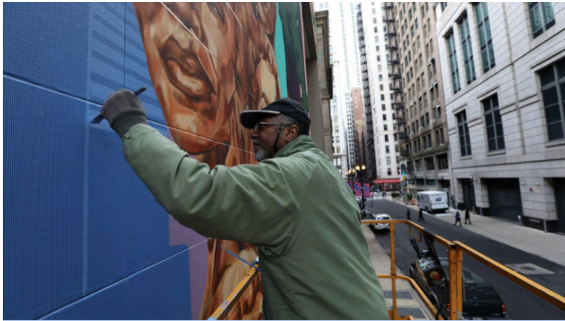
Fig. 1: Kerry James Marshall adds details to Oprah Winfrey's face on Saturday, 2017. Acrylic on limestone. 130 ft by 132 ft. Rush More, Chicago Cultural Center. https://www.chicagotribune.com/entertainment/ct-ent-kerry-james-marshall-mural-unveiled-chicago-1204-story.html