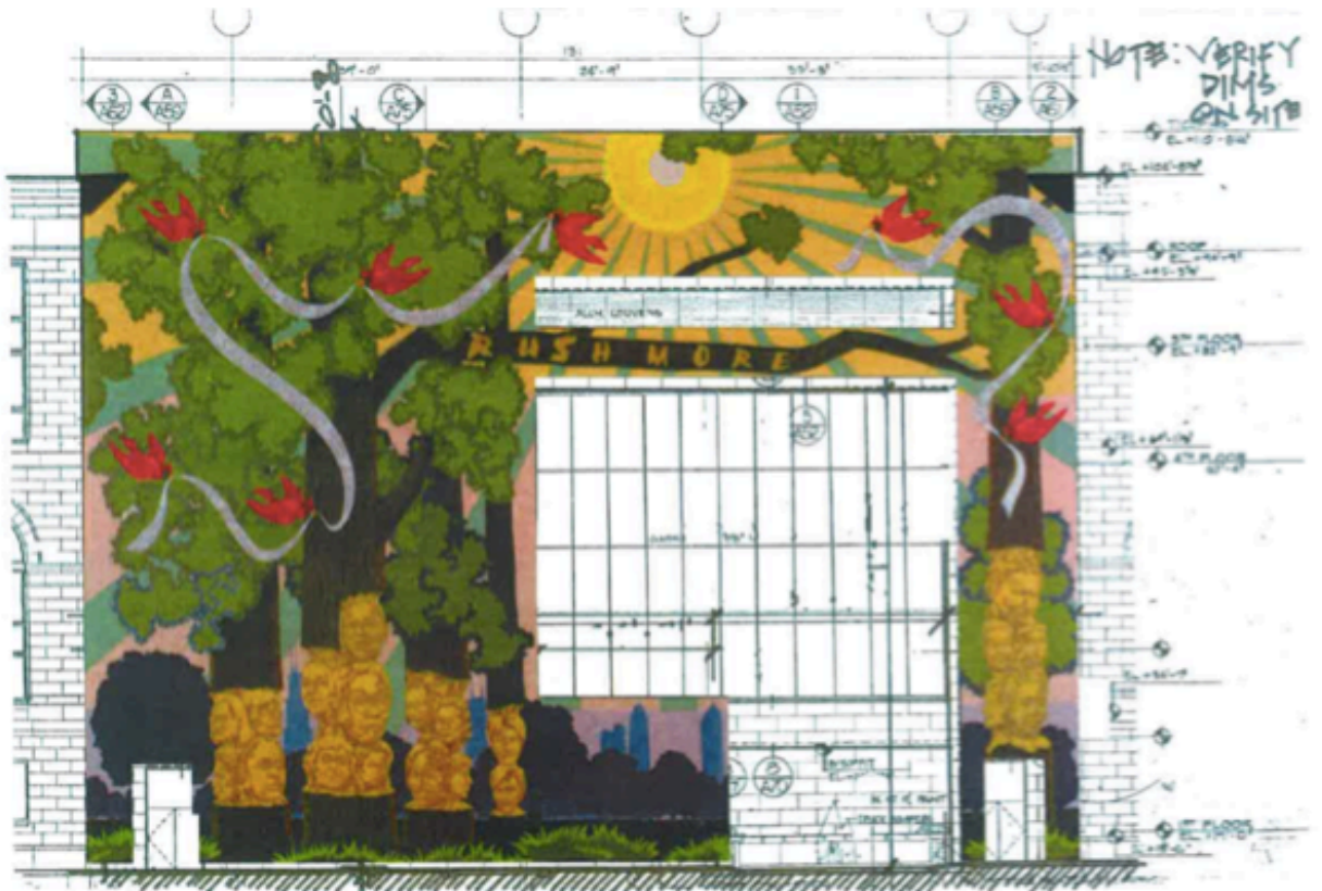
Fig 10: Design for Rush More created by Kerry James Marshall, 2017.