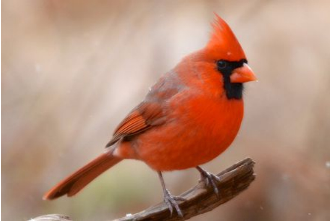
Fig. 9: Jen Goellnitz. Cardinal. 2019. https://www.thespruce.com/northern-cardinal-profile-387268