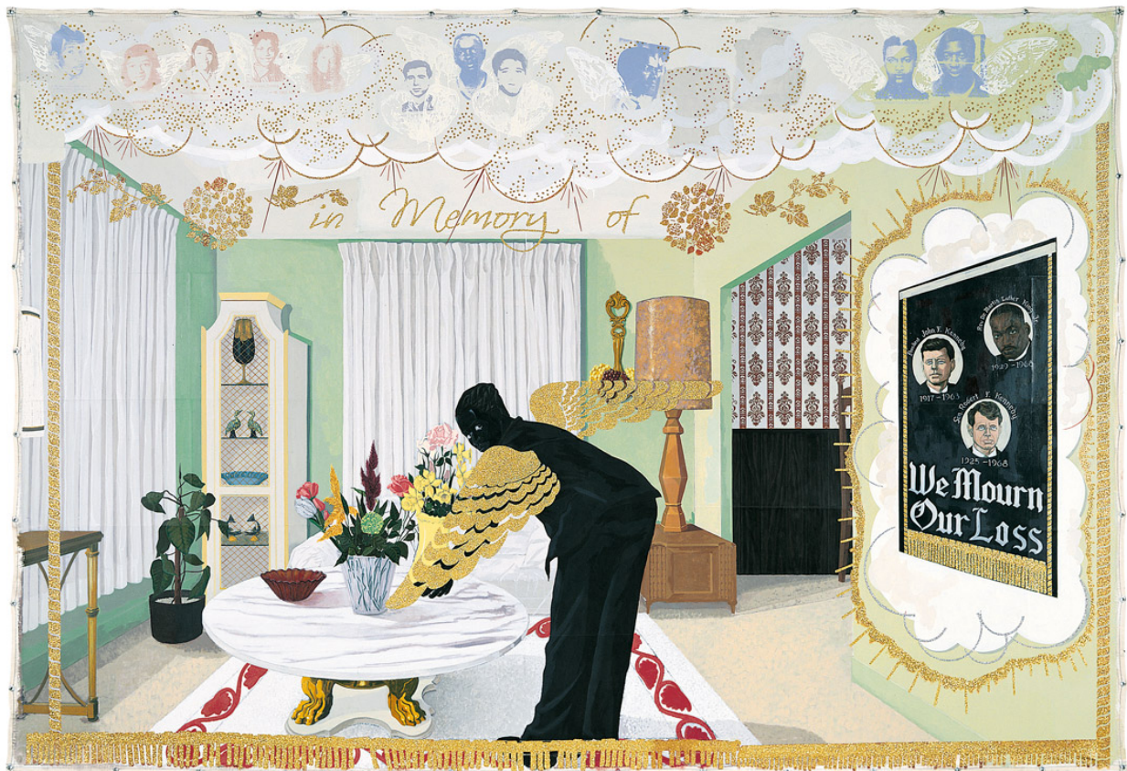
Fig 7: Kerry James Marshall, Souvenir I , 1997. Acrylic, and collage and glitter on canvas 108 × 157 in. (274.3 × 398.8 cm) Collection Museum of Contemporary Art Chicago, Bernice and Kenneth Newberger Fund, 1997.73.