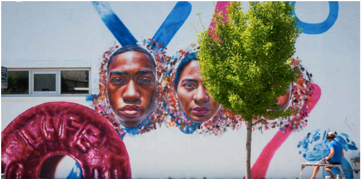
Fig 5: Jeff Zimmermann. Sky Art Mural 2018. Acrylic on Brick. Department of Cultural Affairs and Special Events. Size unknown.