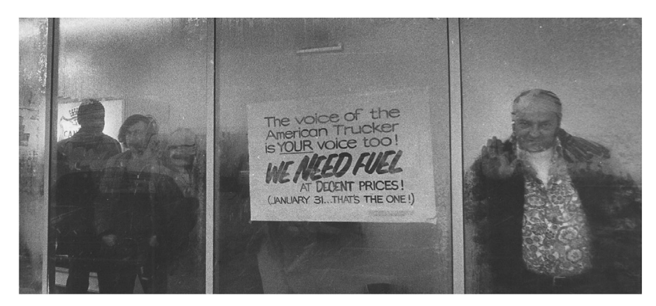
Figure 1. Truckers on strike, early 1974.

When these class fractions' expectations of fair access to energy were challenged, they leveraged their positions at these critical intermediary nodes of fossil fuel society to demand lower energy prices. Both sets of protesters appealed to demotic conceptions of economic justice to demand protective state intervention on energy. Both deployed similar strategies of blockading and supply interruption to make their case, often targeting infrastructures of circulation like the highways. Both drew for their cohesion on cultural ideas of rural authenticity and masculine toughness (Figure 2), though this unity was undercut by the individualistic character of the truck and the tubewell. Even as both movements ultimately fragmented, such high-profile resistance would help to lock in place consumer subsidies for carbon-intensive energy by increasing the perceived political risks of major price hikes. Understanding the dynamics of such energy-dependent class fractions has become increasingly urgent in a world contemplating catastrophic damage from climate change. As states consider rolling back heavy subsidies for fossil fuel consumption, these cases are an omen of the politics of the near future.