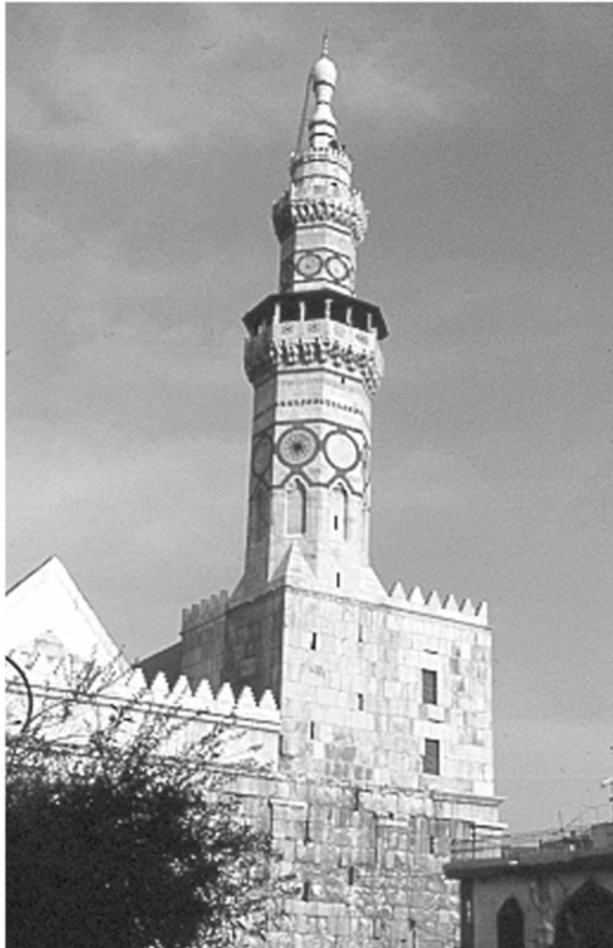
The minaret of Qāyṭbāy above the Roman tower