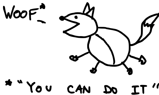
Figure 1: Words of encouragement.

My family, friends, and mentors have supported me in so many ways during my time in graduate school. Your words of encouragement have been very helpful, so let me express my gratitude to you by providing some encouragement of my own (see Figure 1). There is another picture I would like to include but cannot, due to copyright laws.