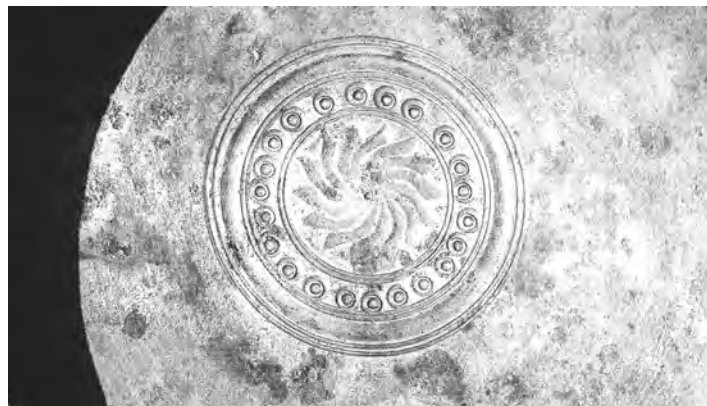
Fig. 22. Engraved circle in the bottom of the late Mamluk bowl of fig. 3.