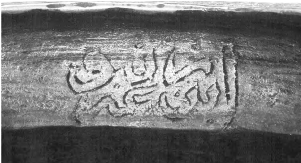
Fig. 11. Signature of Ibn Zanbū'ah on the lidded bowl (fig. 2), Khalili Collection (MTW 527)