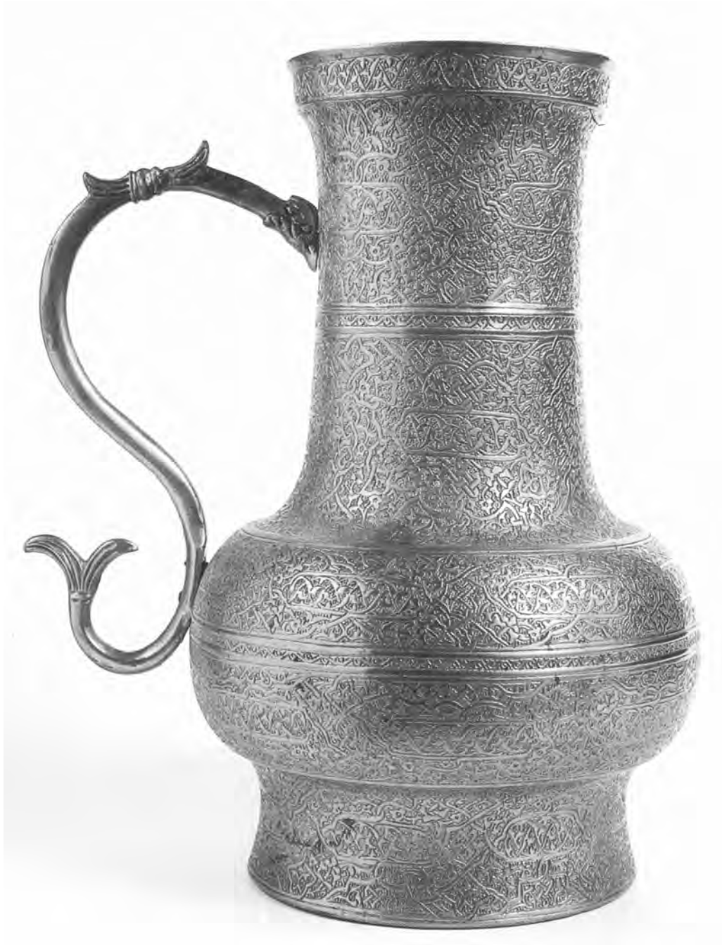
Fig. 5. Jug of Veneto-Saracenic style, Poldi Pezzoli in Milan (Inv. 1656)