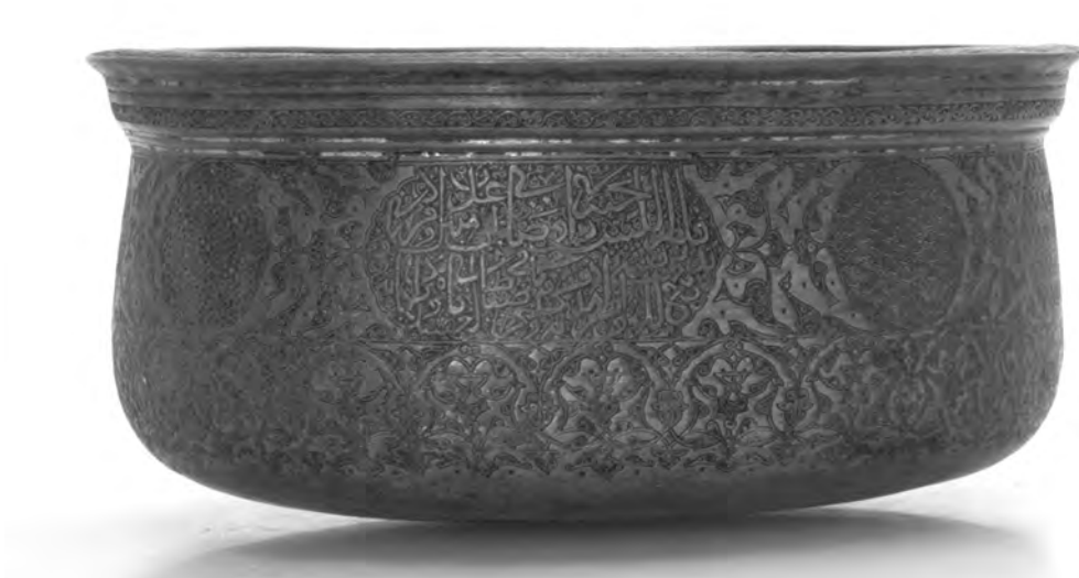
Fig. 3. Late Mamluk bowl in the Khalili Collection (MTW 1349)