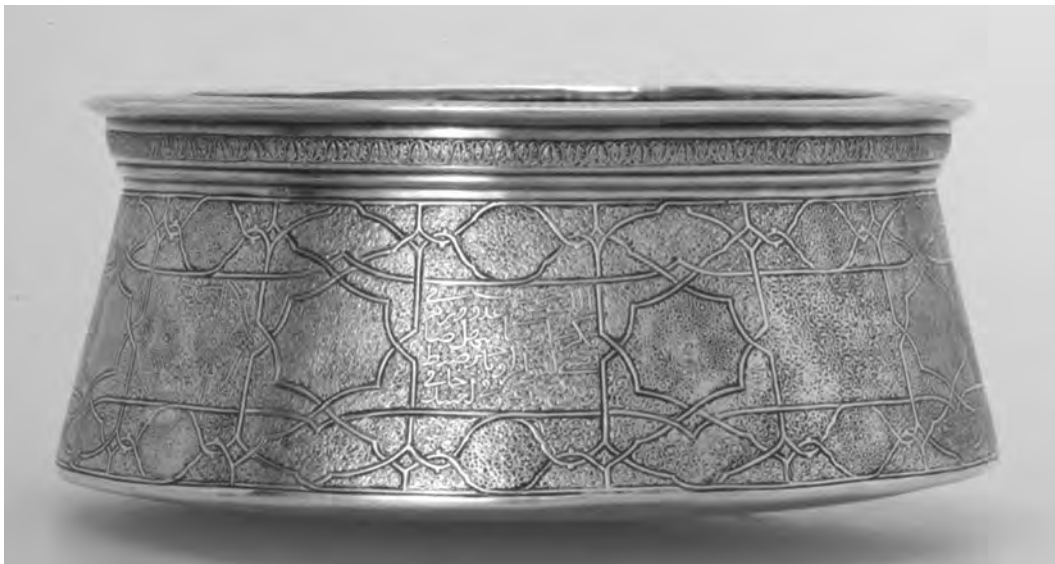
Fig. 14. Bowl signed by al-mu‘allim Maḥmūd, Khalili Collection (MTW 1542)