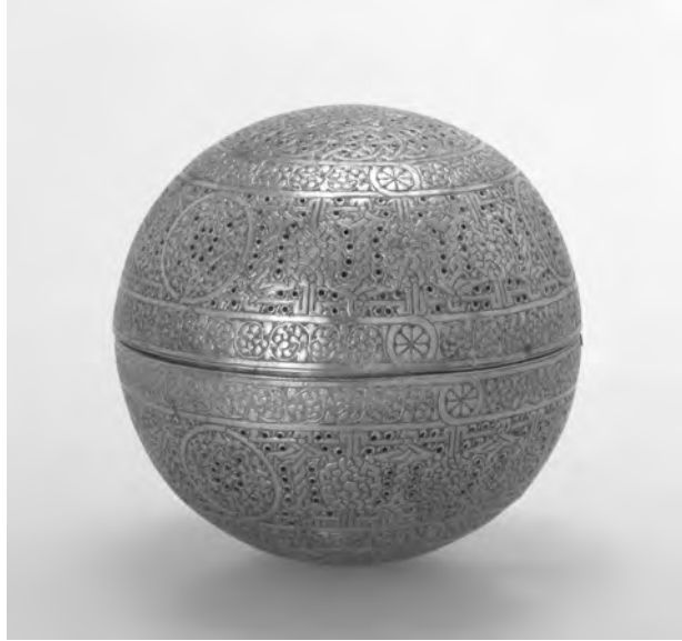
Fig. 1. Spherical hand-warmer or incense burner, Khalili Collection (MTW 1520)