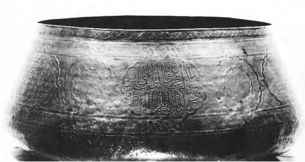
Fig. 18. Late Mamluk basin in the Benaki Museum (13068)