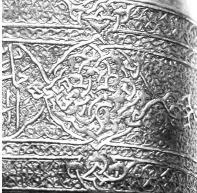
Fig. 6. Detail of a late Mamluk casket, Victoria and Albert Museum (Inv. 377-1897)