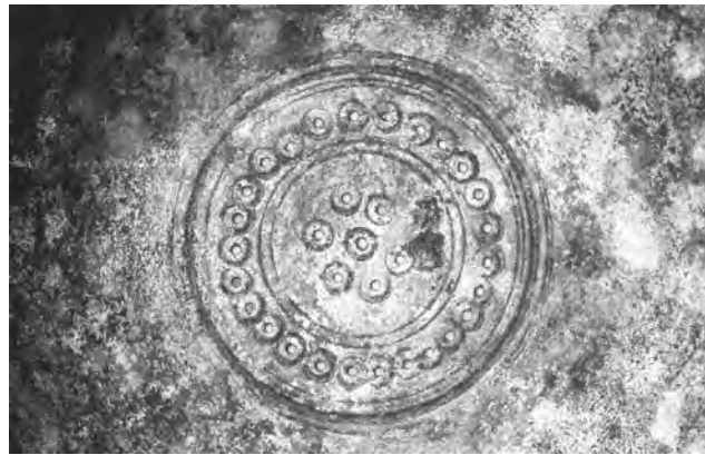
Fig. 20. Engraved circle in the bottom of the Maḥmūd bowl in the Khalili Collection.