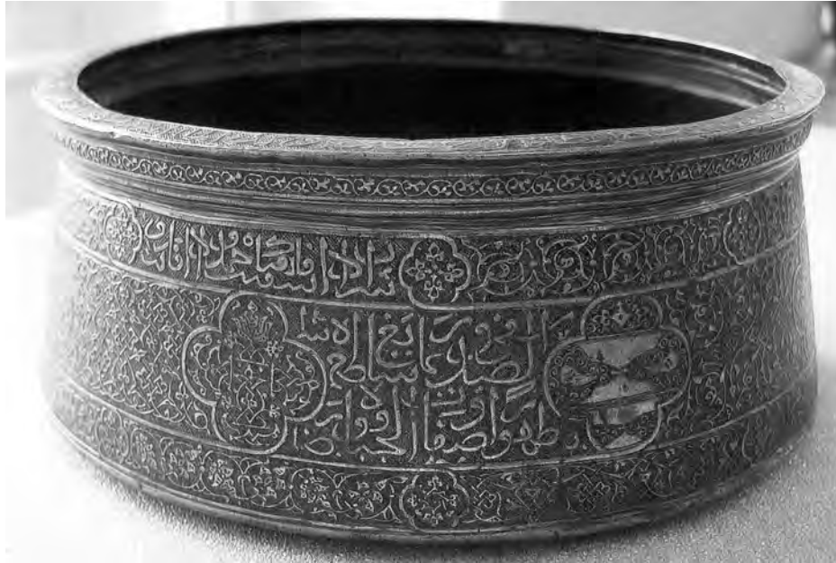
Fig. 16. Copper bowl in the Ashmolean Museum (1982.6)