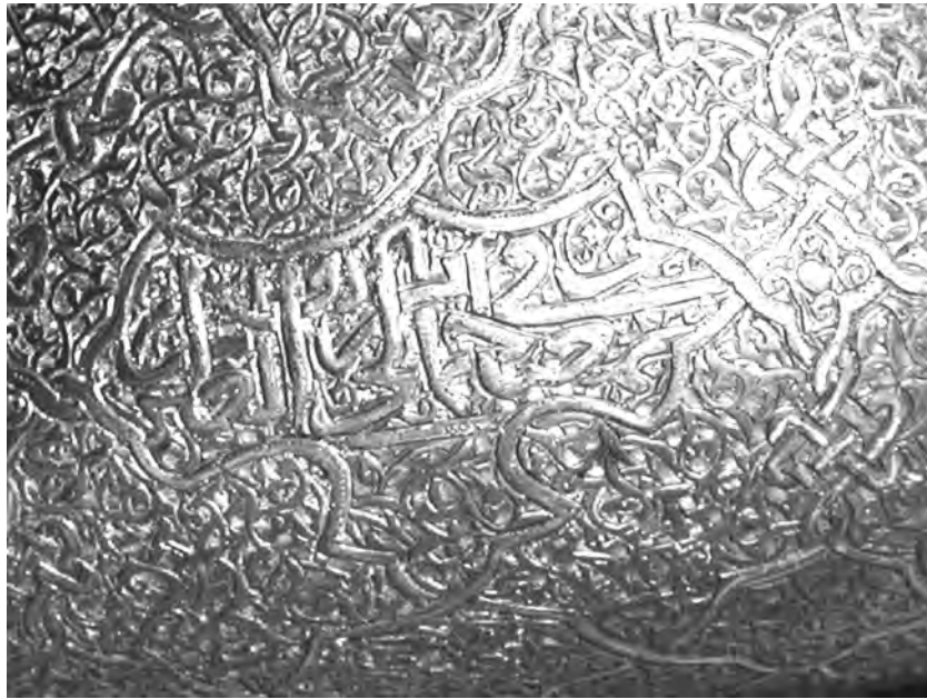
Fig. 8. Inscribed cartouche of the Veneto-Saracenic bucket in the Islamic Museum in Berlin (B72)