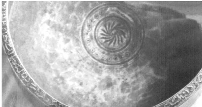
Fig. 21. Engraved circle in the bottom of the bowl in the Ashmolean Museum