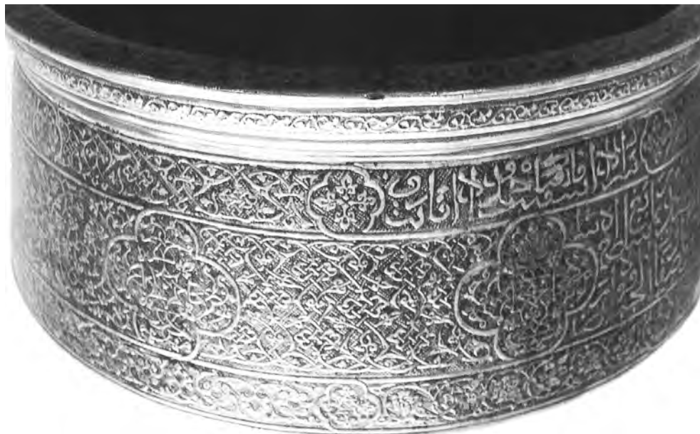
Fig. 17. Detail of copper bowl in the Ashmolean Museum