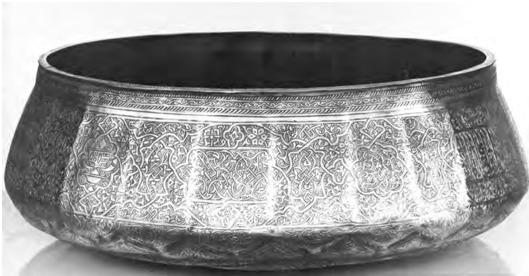
Fig. 4. Basin in Veneto-Saracenic style with Mamluk inscriptions and blazon, Poldi Pezzoli Museum, Milan (Inv. 1657)