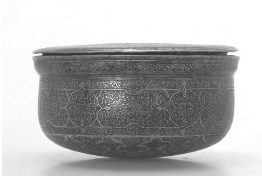
Fig. 2. Lidded box, Veneto-Saracenic style, signed by Zayn al-Dīn Ibn Zanbū‘ah, Khalili Collection (MTW 527)