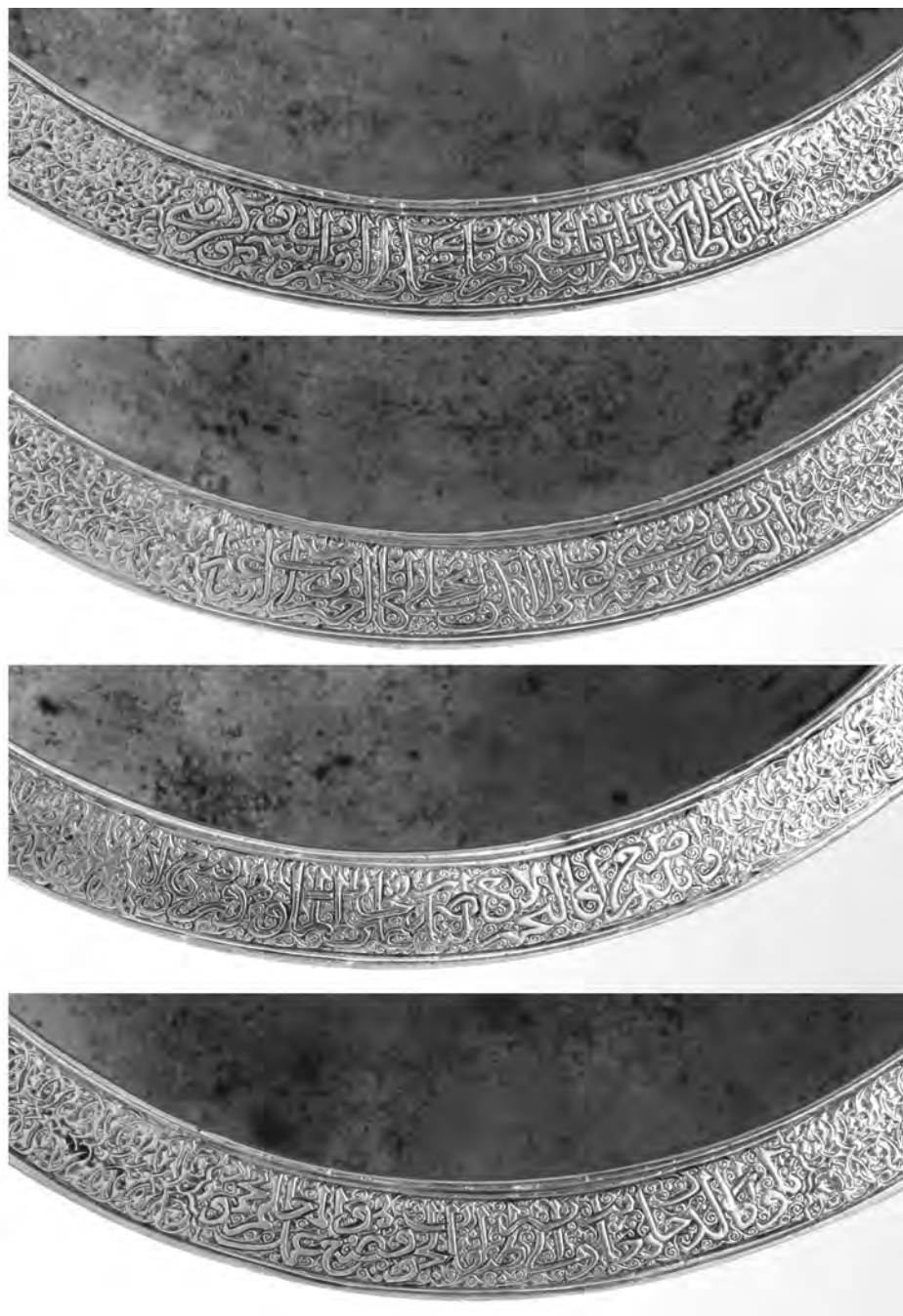
Fig. 15. Inscriptions on the rim of the bowl signed by al-mu'allim Maḥmūd in the Khalili collection (MTW 1542)