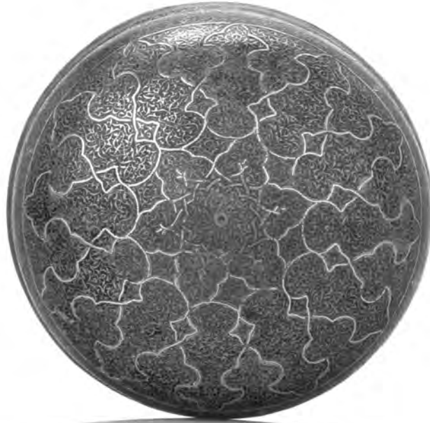
Fig. 13. Bottom of the bowl of Zayn al-Dīn Ibn Zanbū‘ah, Khalili Collection (MTW 527)