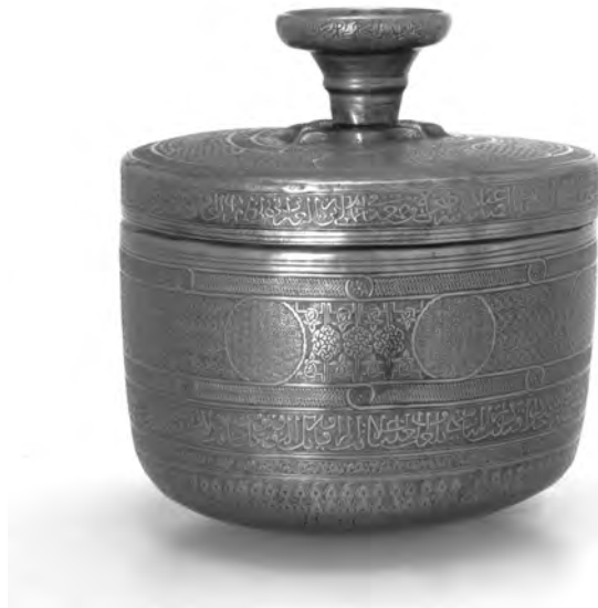
Fig. 9. Late Mamluk lidded box, Khalili Collection (MTW 527)