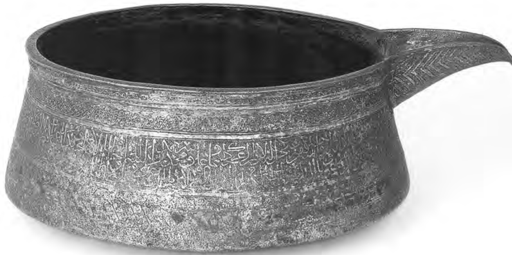
Fig. 10. Late Mamluk spouted bowl, Benaki Museum in Athens (33701).